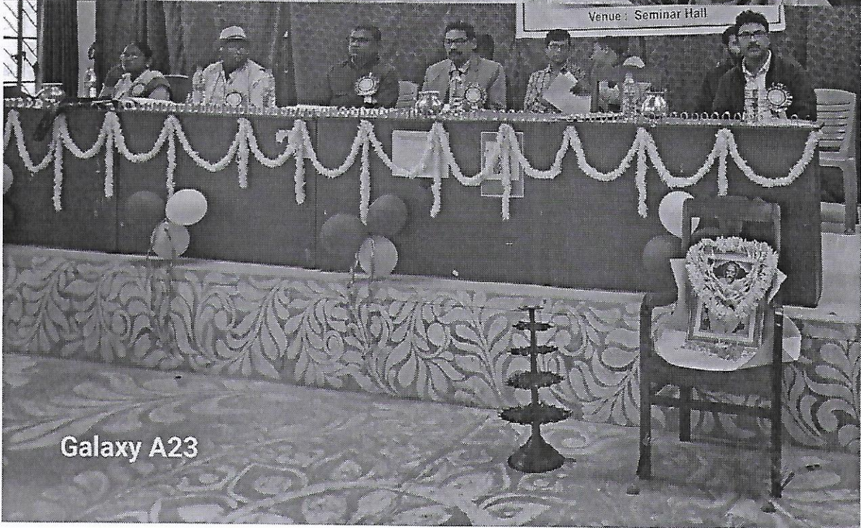
Some photos of the event